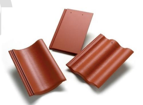
Figure 1 Illustration of the three concrete rooftiles Carisma, Palema and Exklusiv products assessed, all the three concrete rooftiles are valid for the functional unit.

The concrete products are made of cement, gravel, and water. A small amount of sand and iron oxide is also included in the products. Lastly, it is painted with surface treatment paint for its final appearance. The three production sites in Edsvära, Bålsta and Braås use slightly different raw material compositions, and use different manufacturing fuels. The finished products are prefabricated concrete rooftiles and accessories. The final products are packed, and one fraction of the packaged products is distributed from the production site to the warehouse in Åstorp for storage. The other fraction is stored at each production site and then distributed directly to the user.