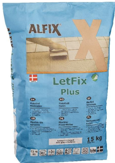
Figure 1: LetFix Plus packed in paper bag.