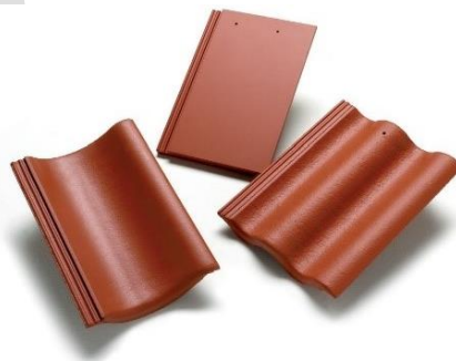
Figure 1 Illustration of the three concrete rooftiles Carisma, Palema and Exklusiv products assessed, all the three concrete rooftiles are valid for the functional unit.

The concrete products are made of cement, gravel, and water. A small amount of sand and iron oxide is also included in the products. Lastly, it is painted with surface treatment paint for its final appearance. The three production sites in Edsvära, Bålsta and Braås use slightly different raw material compositions, and use different manufacturing fuels. The finished products are prefabricated concrete rooftiles and accessories. The final products are packed, and one fraction of the packaged products is distributed from the production site to the warehouse in Åstorp for storage. The other fraction is stored at each production site and then distributed directly to the user.