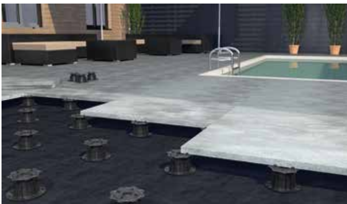
Der GIANT M installed beneath a stone terrace.