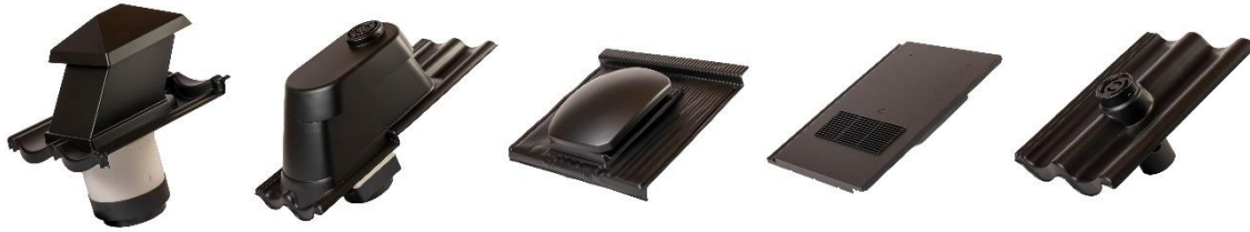
Figure 1 Example of 4 of the 23 products covered in this EPD (HV15x15, HV Combi, LV125 and DL75).

Below are pictures of 4 of the 23 products covered by this EPD. Photos of remaining products can be found at https://japlast.com/ .