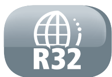
Environmental friendly refrigerant