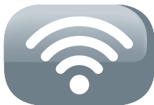
Wireless smart kit