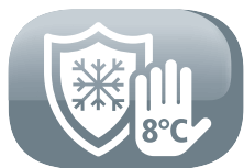
Home freezing prevention