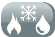
3 functions in 1