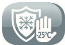
Extra frost protection in outdoor unit