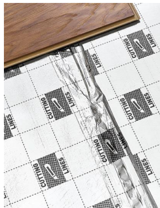
Thickness 2,0 mm