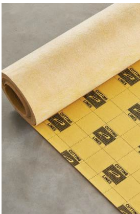
Thickness: 1,1 mm

This environmental declaration type III covers products from the polyurethane-mineral (PUM) underlays group. The products are made of polyurethane foam with a mineral filling and laminated with PET. The underlay for floor panels is an important element of the new floor, which significantly affects its durability, improves the acoustic comfort by high level of noise reduction. Products (figure 1) are intended to be used for rooms with high traffic intensity and provide heavy load resistance. The products are manufactured in three basic thicknesses from 1.1 to 3.0 mm. The basic products are 1,1mm, 1,5mm, 2,0mm and 3,0mm. All products have a set of tests in accordance with the EN 16354 standard.