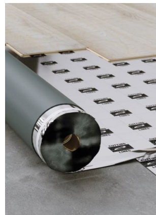
Thickness: 3,0 mm