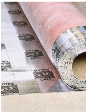
Thickness: 1,5 mm