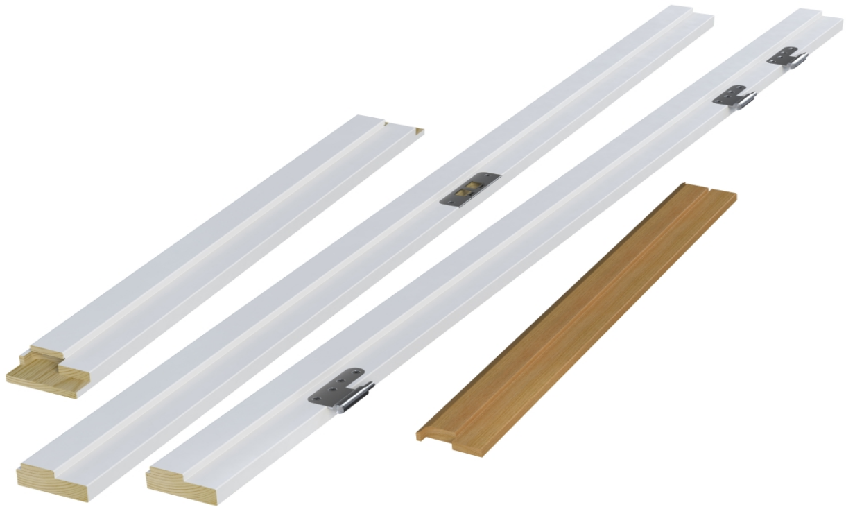
Figure 1 Painted frameset for a door leaf.

JELD-WEN holds FSC multi-site certificate since 2011. Majority of JELD-WEN products on the European market are available as FSC and PEFC certified.