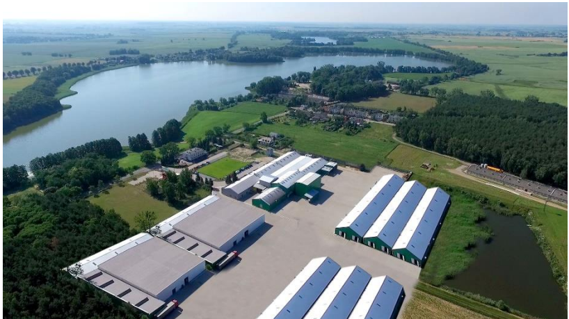
Figure 1 Fair Packaging production plant in Buszewo, Poland

Fair Packaging Sp. z o. o. Sp. k. has been producing and processing products made of foamed polyethylene for over 20 years. The beginnings of the company's activity were mainly the production of simple industrial packaging. Today, thanks to intensive R&D work, Fair Packaging supplies leading brands from the automotive, electronics, household appliances, furniture and construction industries.