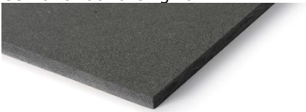
Cembrit Patina Original