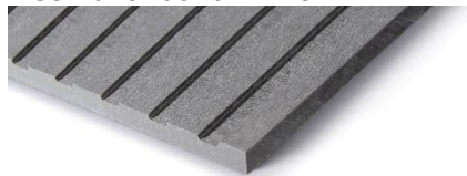
Cembrit Patina Inline