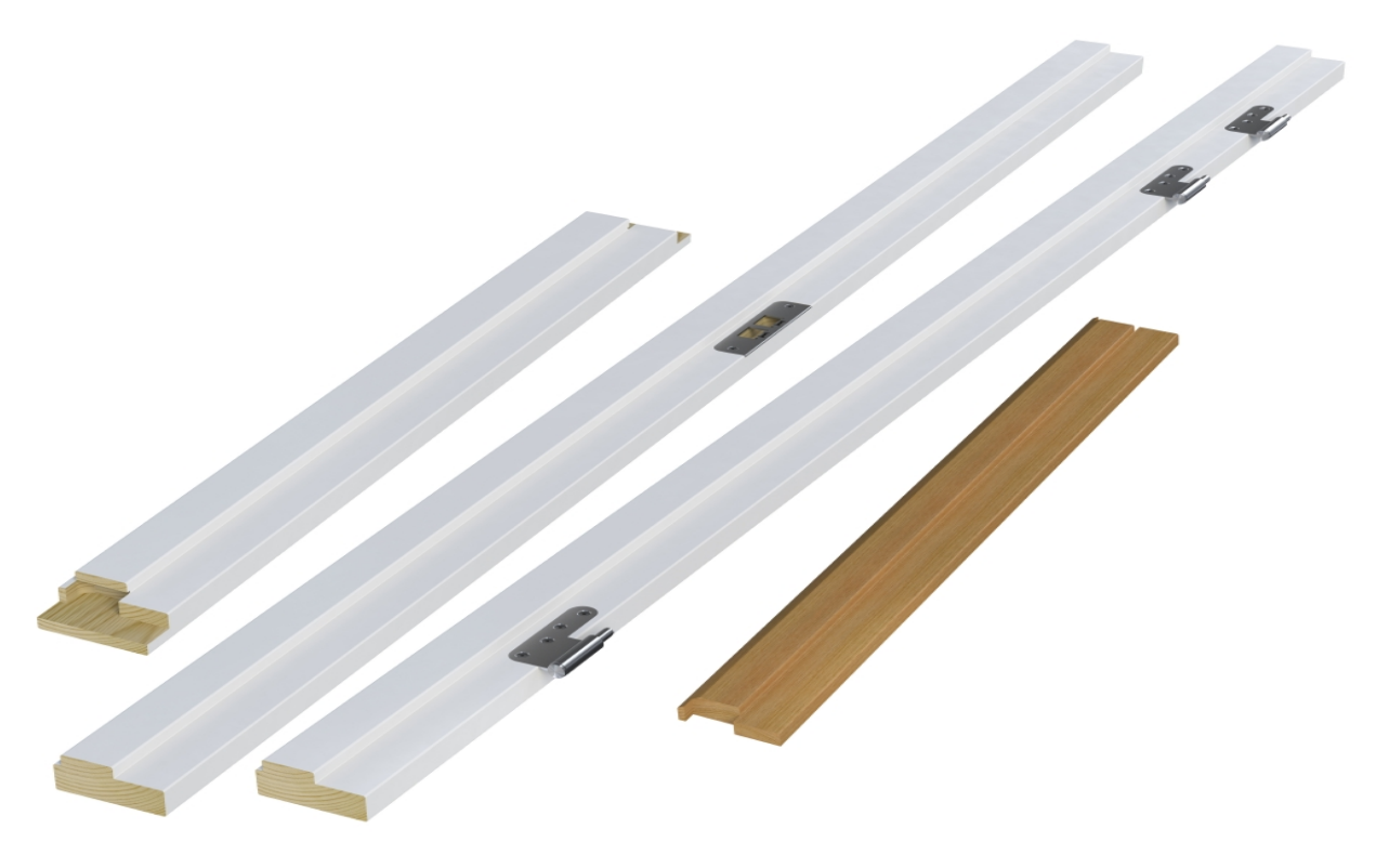
Figure 1 Painted frameset for a door leaf.

JELD-WEN holds FSC multi-site certificate since 2011. Majority of JELD-WEN products on the European market are available as FSC and PEFC certified.