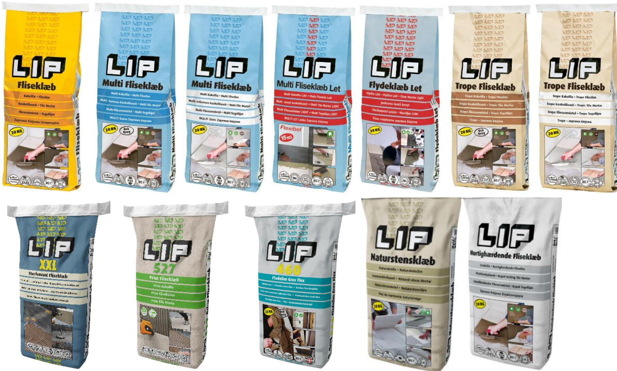
Figure 1: Pictures of the LIP products covered in this project report.

LIP Tile Mortar, LIP Multi Tile Mortar – Grey and White, LIP Multi Tile Mortar Light, LIP Flow Mortar Light, LIP Tropic Tile Mortar – Grey and White, LIP Tile Mortar XXL, LIP 527 Tile Mortar, LIP 460 Sheet adhesive coarse flex, LIP Natural Stone Grout and LIP Rapid-Setting Tile Adhesive.